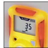
Easy to See