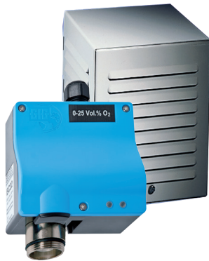
ZD 22 with weather protection

A weatherproof housing not only protects transmitters against exposure to wind and weather, but also against contamination and excessive temperatures caused by direct sunlight.