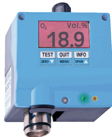
Graphical display with control buttons