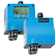
ZD 22 Transmitter with display and no display

There are a variety of applications for the ZD 22 in regard to sensors, status LEDs and optional analog or digital interface, "Zero" key to calibrate the zero point, test socket and a potentiometer for the calibration of the sensor.