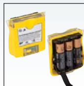
Always ready when you are