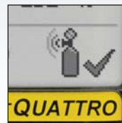
Simple, visual compliance