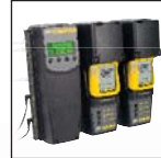
MicroDock II compatible